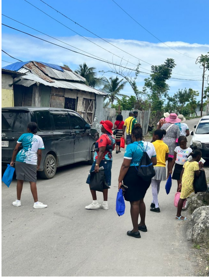
Global Youth Day 2026 in West Jamaica Conference on March 21:: Photo credit: Contributed.