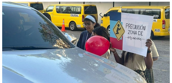
Students from the Adventist Metropolitan School in Panama City pray with a driver during a “Drive-Thru Prayer” initiative held as part of the Annual Day of Prayer.

According to Patterson, nearly 90 percent of Adventist educational institutions across the IAD participated in this year’s initiative. There are nearly 1,000 primary and secondary schools in the IAD.