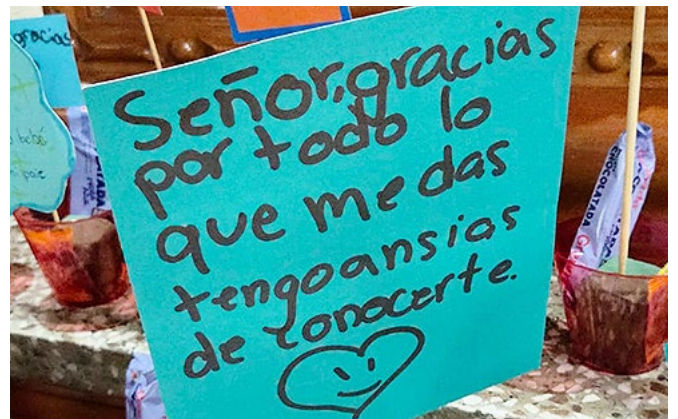
A student's handwritten message of gratitude is displayed among prayer notes at the JUBA Adventist School in Guatemala City, Guatemala, on March 11, 2026, as part of the Annual Day of Prayer initiative.

Across campuses, classrooms gave way to worship services, group prayer, outreach activities, and moments of reflection, as both students and teachers engaged in the annual observance, now held for more than a decade.