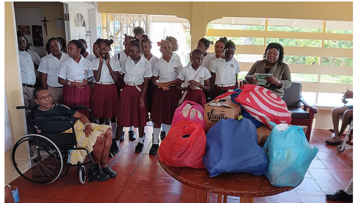
Students from the Seventh-day Adventist Comprehensive School in Grenada distribute essential goods and pray with residents at a home for the elderly as part of the Annual Day of Prayer outreach.