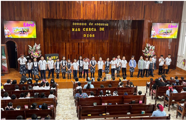
Students from Colegio Adventista de la Llave in Minatitlán, Veracruz, take part in a prayer activity as part of the Annual Day of Prayer.

“What has impacted us most is how prayer has moved from being an event to becoming a true institutional culture,” she said. “It is no longer limited to special days but is part of the daily life of our schools, classrooms, and leadership.”