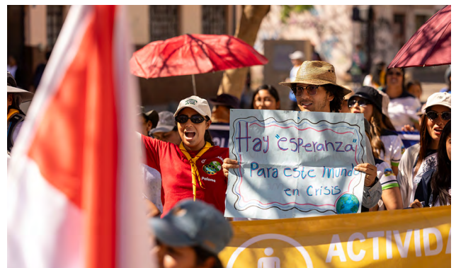
"There Is Hope for This World in Crisis," reads one of many signs carried by hundreds of young people offering during a two-kilometer march through Guadalajara, Jalisco, Mexico, on Global Youth Day, March 21, 2026.

The annual initiative, led by the General Conference Youth Ministries Department, encourages young people to step out of their comfort zones and "Be the Sermon."